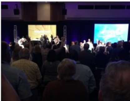
Missio Nexus Conference