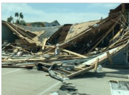
Rockport, Texas clean up

right after hurricane Harvey struck their homes in Rockport, Texas. It was a blessing to serve alongside one another and see so many others from different communities and states work side by side to clear debris, serve meals, restore power and encourage the residents in the midst of their hardships.