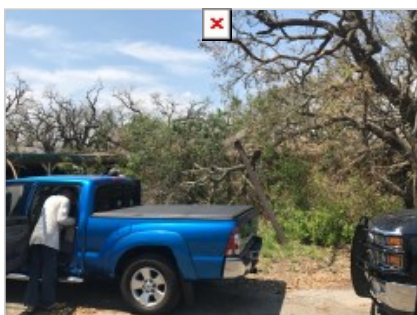
Before clean up