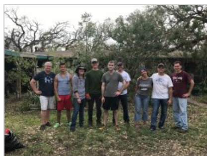
After clean up