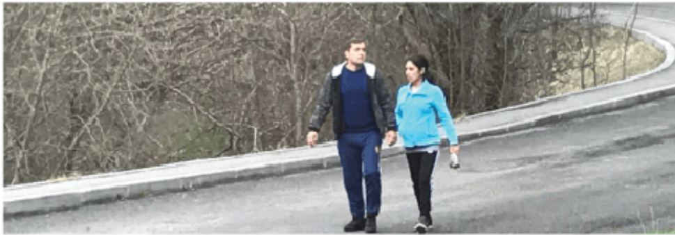
There was time for meaningful conversations

We saw how Jesus is superior in every way, through every age and to every thing and looked at practical ways to keep Him first in all things. Finally, as adopted children of God through faith we been given a completely new identity and are accepted, secure and significant in Christ . There is nothing too big or too hard for Jesus to handle in our lives! The Lord of Lord's is both our King and Father.